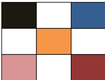
Comb 1 Comb 2 Comb 1

Put these 2 combinations of strips together like this: